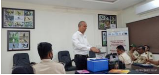
Hands on training of the frontline staff of Navegaon-Nagzira Tiger Reserve, Maharashtra

Wild-CER works with the philosophy i.e. “frontline staff is the pillar of conservation action.